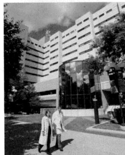
University of Michigan Medical Center Ann Arbor, Michigan