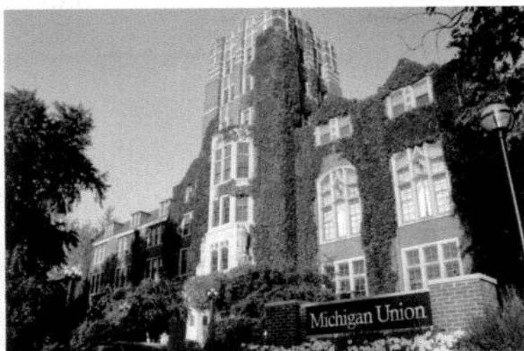
Michigan Union Ann Arbor, Michigan

W. LORENZ SURGICAL 1520 Tradeport Drive Jacksonville, FL 32218 Tel: 800-874-7711 Fax: 904-741-4500